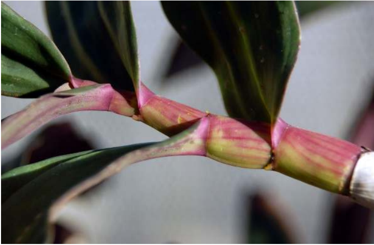
This Dendrobium capituliflorum reacts to high light by taking on a reddish cast of anthocyanin. For some orchids, this is an indicator that the plant is receiving the proper amount of light.

Too much light, causing the obvious response of varying degrees of burning or stunting, can be fairly easily remedied by shading. Growers outdoors or in greenhouses usually cannot do without some shading, especially in the summer. Those who grow orchids in windows only occasionally are faced with too much sunlight, but burning can be more insidious under these conditions. Windowsill hobbyists who are not careful to observe all sides of their plants, and to rotate them periodically, may discover to their dismay (as I did, with the ascocenda pictured in Part 2 of this series) that while the side of the plant facing inward may show no signs of light stress, the less apparent — and most exposed — side facing the window may be cooking to a crisp. Regular rotation of plants will prevent this — and lopsidedness, since orchids grow toward light. It is best not to disturb a plant while in spike, however, so as not to confuse the orientation of the flowers.