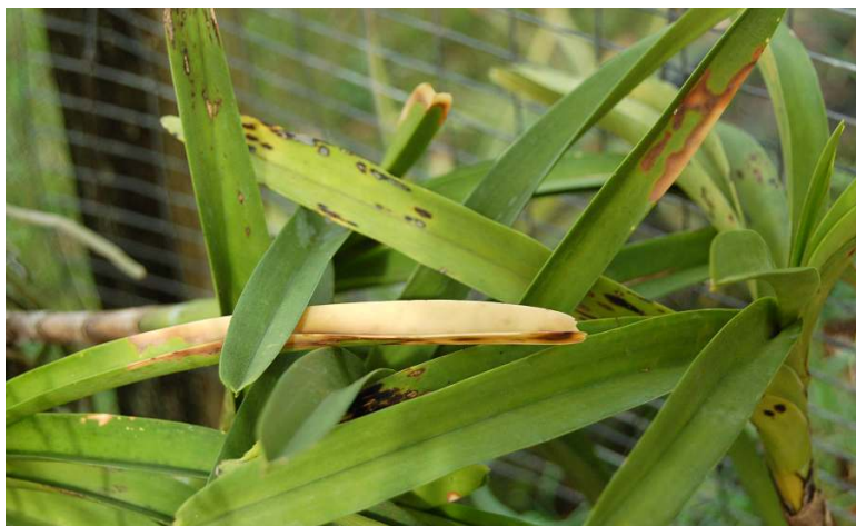
ABOVE , Freezing temperatures in a South Florida shadehouse caused the bleached and sunken areas on these Ascocenda leaves. BELOW , In contrast, the necrotic patches on this Rlc. Goldenzelle is a result of searing greenhouse temperatures induced by high light intensities. The hard and rough feel of this dead tissue distinguishes it from the soft, limp character of recently frost-damaged, succulent tissue.

sue itself is the real concern, and one deciding factor, besides ambient temperature, is light.