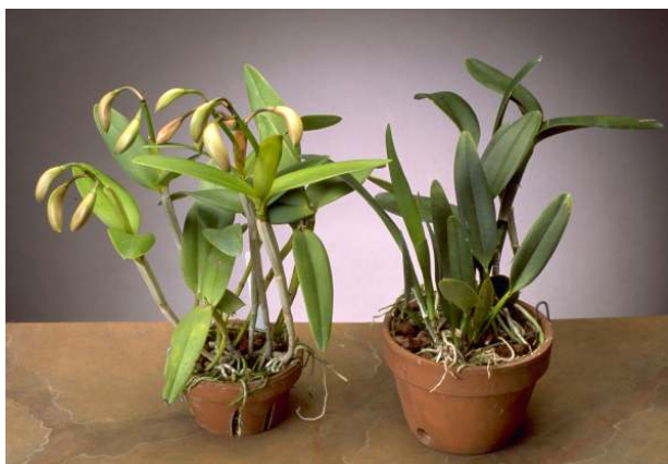
ABOVE, The plant on the left has received adequate light and is producing the expected number of flowers. The plant on the right has not received enough light to produce any flowers. Both are the same clone of C. intermedia .

A number of orchids also tested, while insensitive to daylength, were found to be "low temperature responders", flowering only after a night temperature of 55°F (13°C) or less had been provided for a period of time. Several cymbidiums, dendrobiums, and a Paphiopedilum species have been put into this category. For a survey of the rather scanty information on the subject of flower induction by photoperiod or temperature, see REFERENCES: Rotor, 1959; Arditti, 1966, 1967.